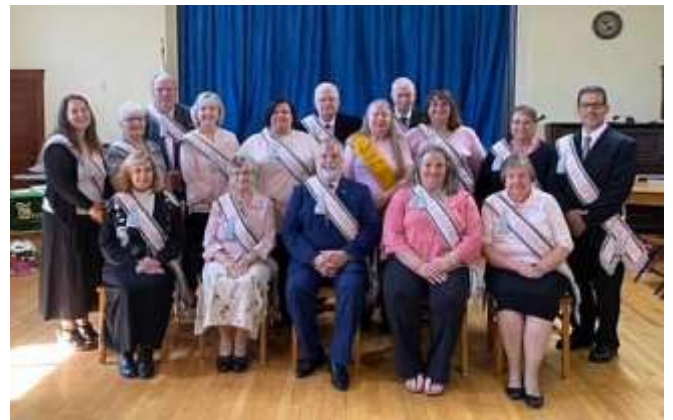
2022-2024 Rhode Island State Grange Officers